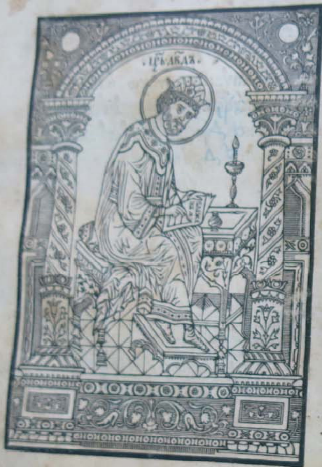
Old Lipovan prayer book