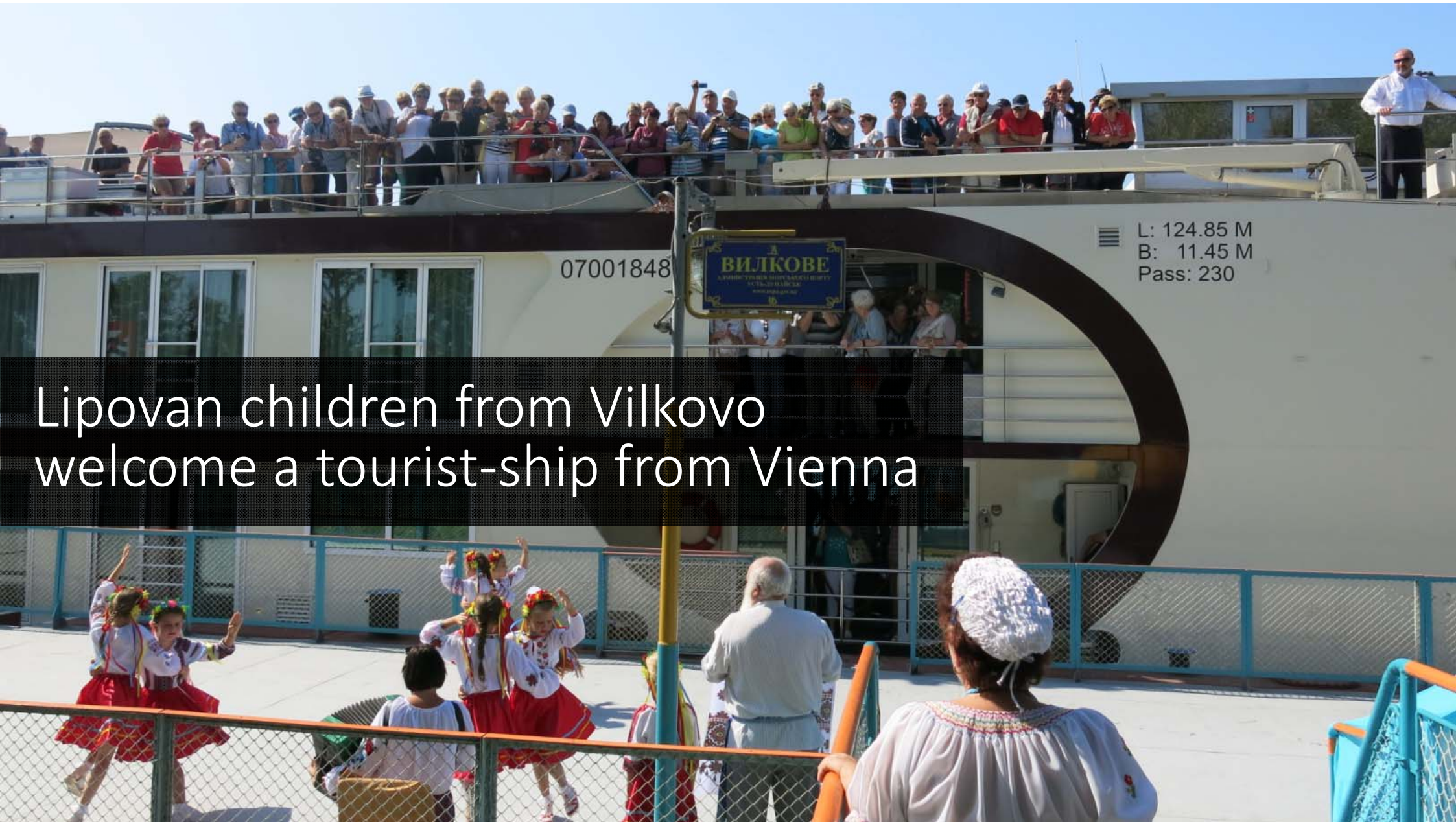
Lipovan children from Vilkovo welcome a tourist-ship from Vienna