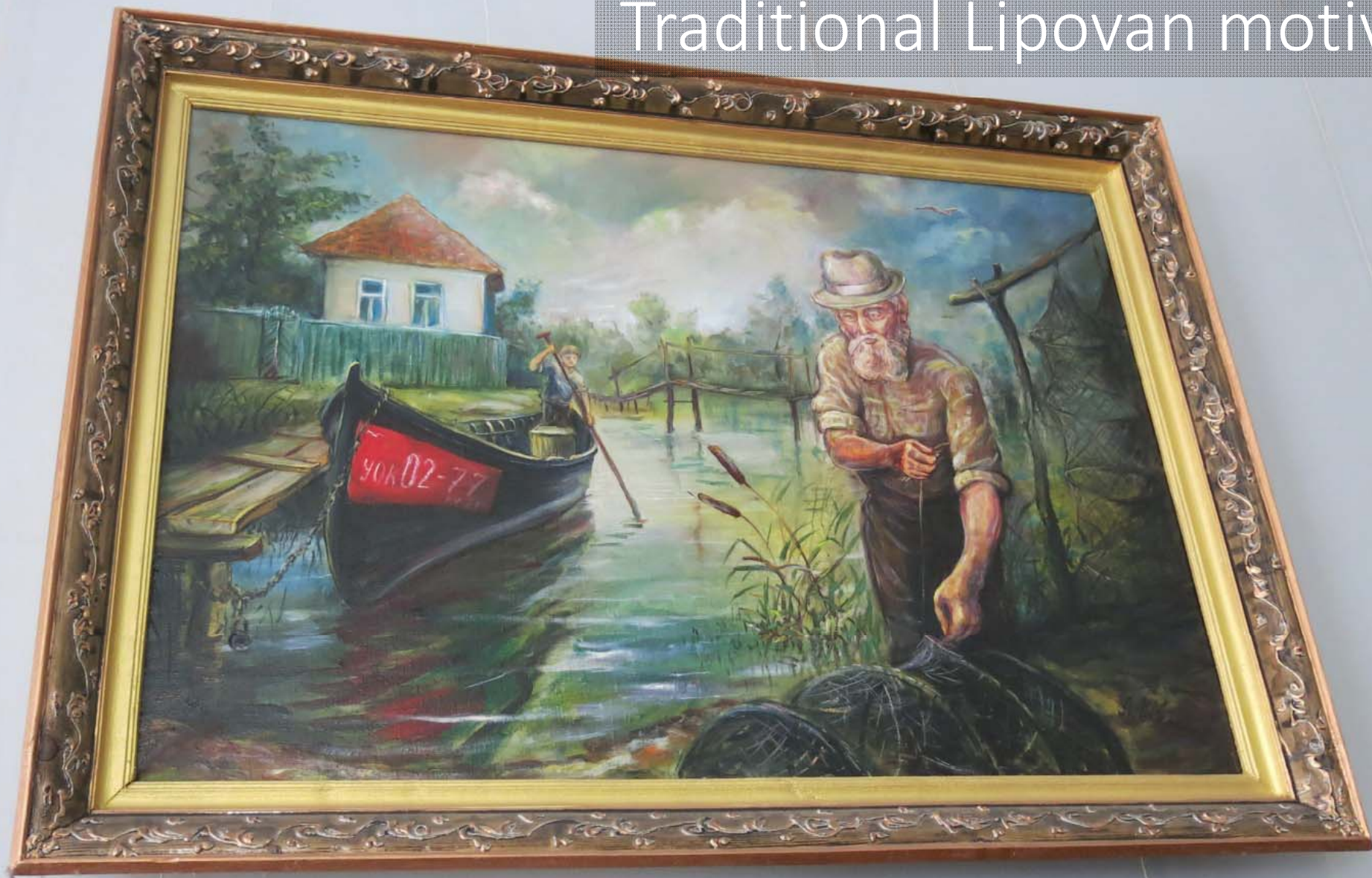
Traditional Lipovan motive