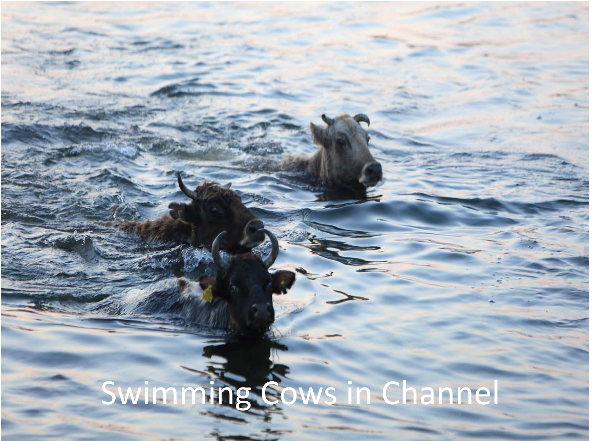
Swimming Cows in Channel