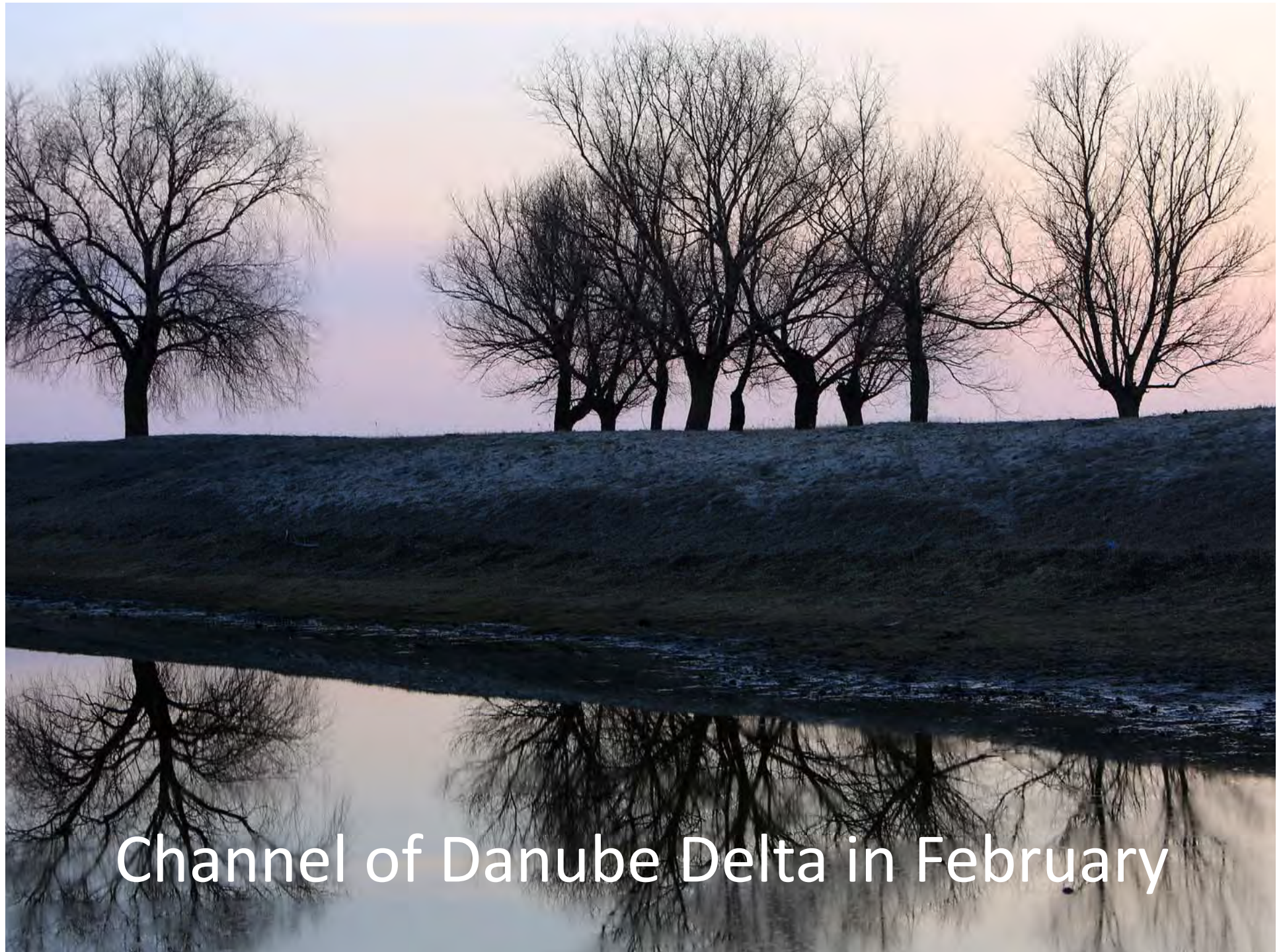
Channel of Danube Delta in February