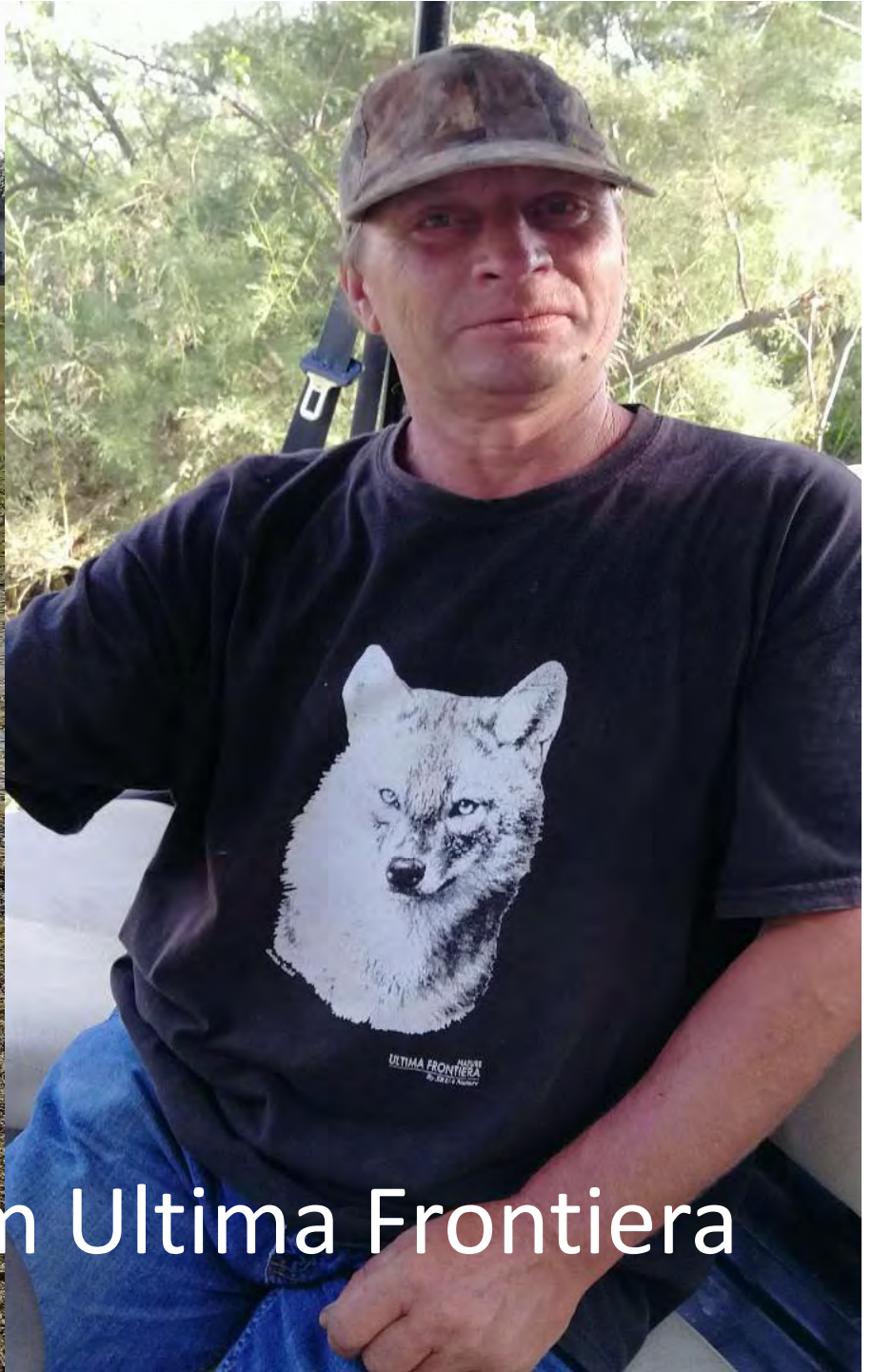
Lipovan Ranger from Ultima Frontiera