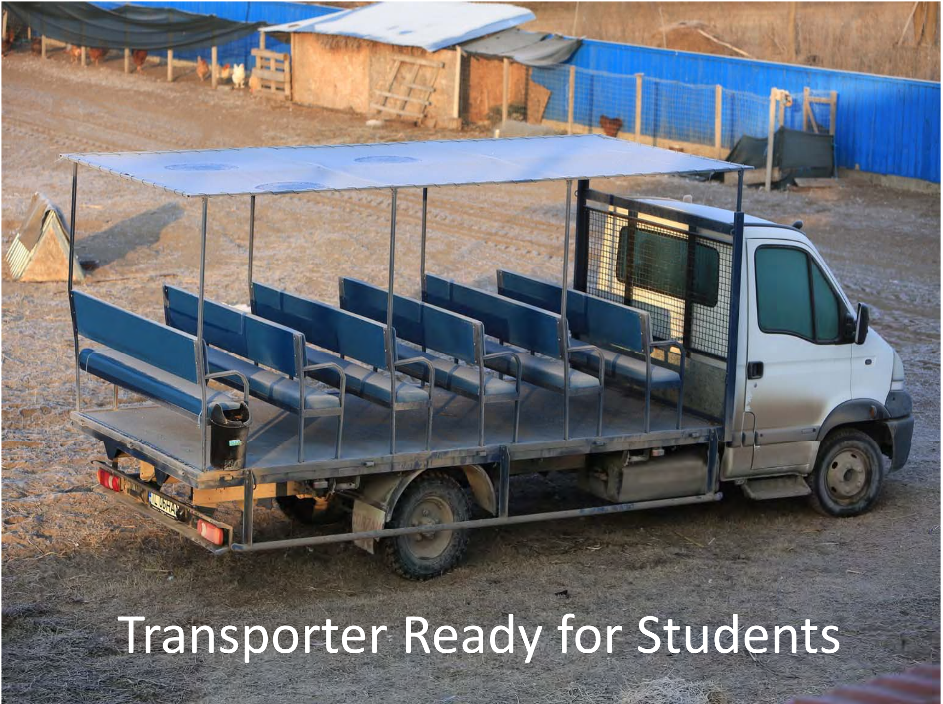
Transporter Ready for Students