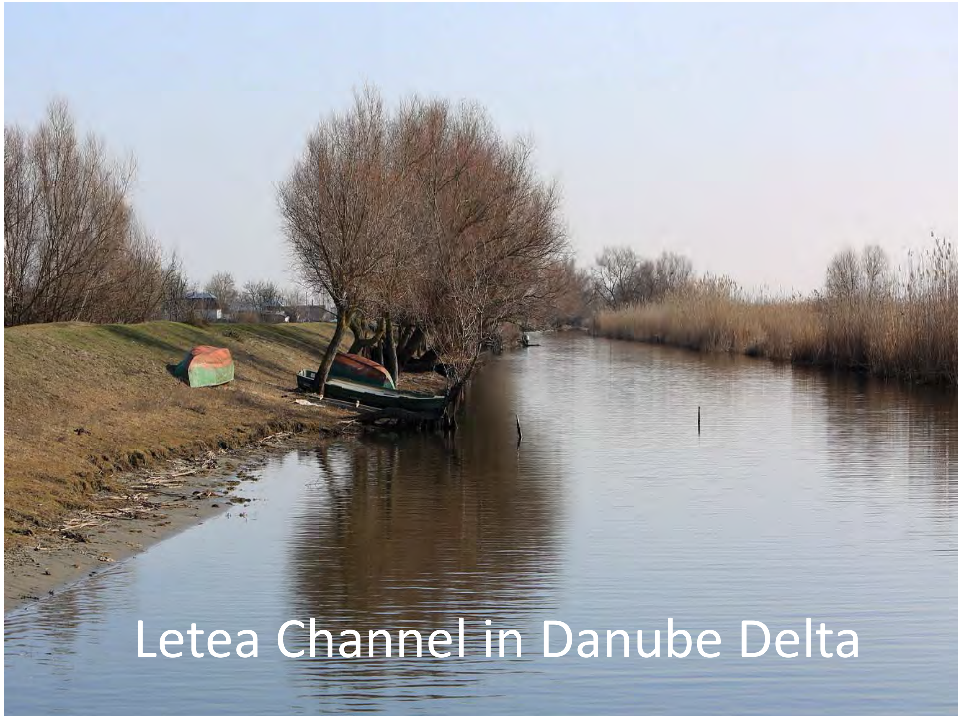
Letea Channel in Danube Delta