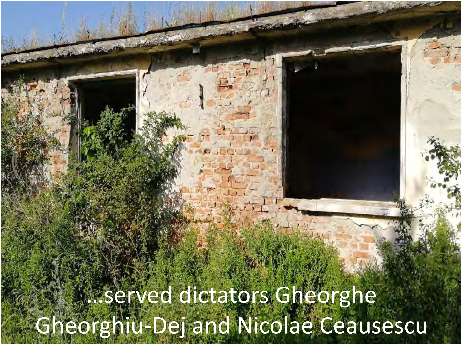
...served dictators Gheorghe Gheorghiu-Dej and Nicolae Ceausescu