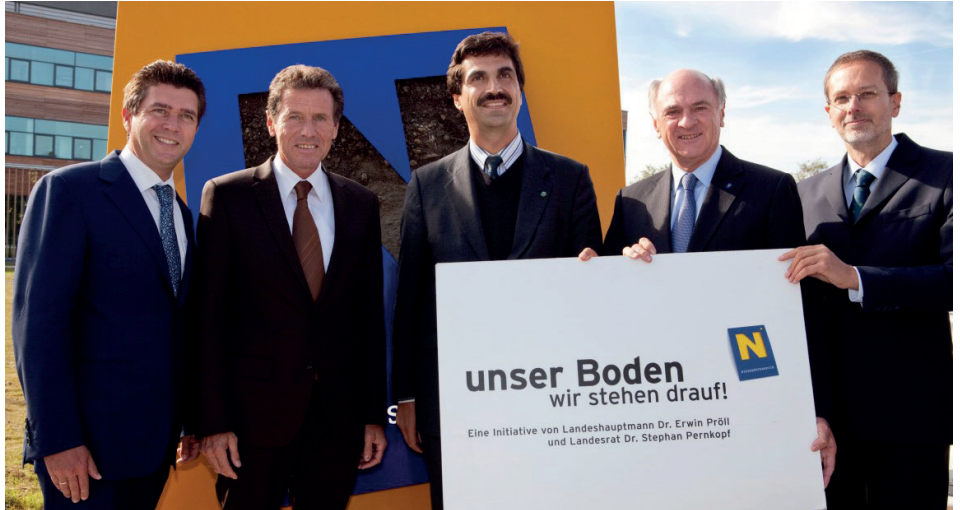
Opening of the University Research Center Tulln, autumn 2011

It is „on time“ to recognize our soil as the primary base of production and life, to appreciate the value of soil, and to sensibly use and carefully protect soil.