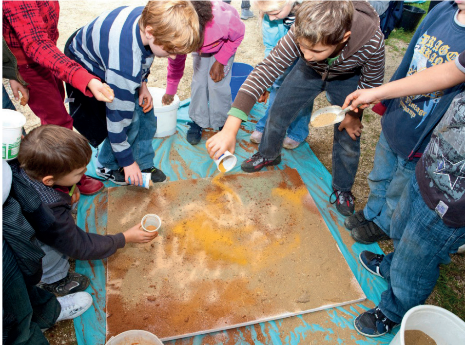
kids in action.

In all of Europe, pieces of art by school girls and boys have been created by painting with the Colours of the Earth, which visit Europe as a permanent exposition. Trainings of