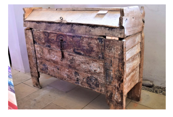
Chest from the Evangelical church in SighiŞoara/Schäßburg

At the same time, the decorative elements of the church and the furniture, found at windows, pulpits, altars, portals, organs, epitaphs and frescoes endows the ensemble with the status ofcentre of the artistic activity. The sensitivity with which all these elements have been manufactured, painted or carved, denotes a profound understanding and perception of the world than can be found as well in the interior of their homes, an aspect that symbolizes a universal attachment to the entity of the church as the place of sheltering their essence in the first place, not a religious connection, which is most often seen as the primordial role of the church in other religions. The religion evolves visually in parallel with art without inducing a certain concept or truth, because itallows alternations and differences of vision on the world.