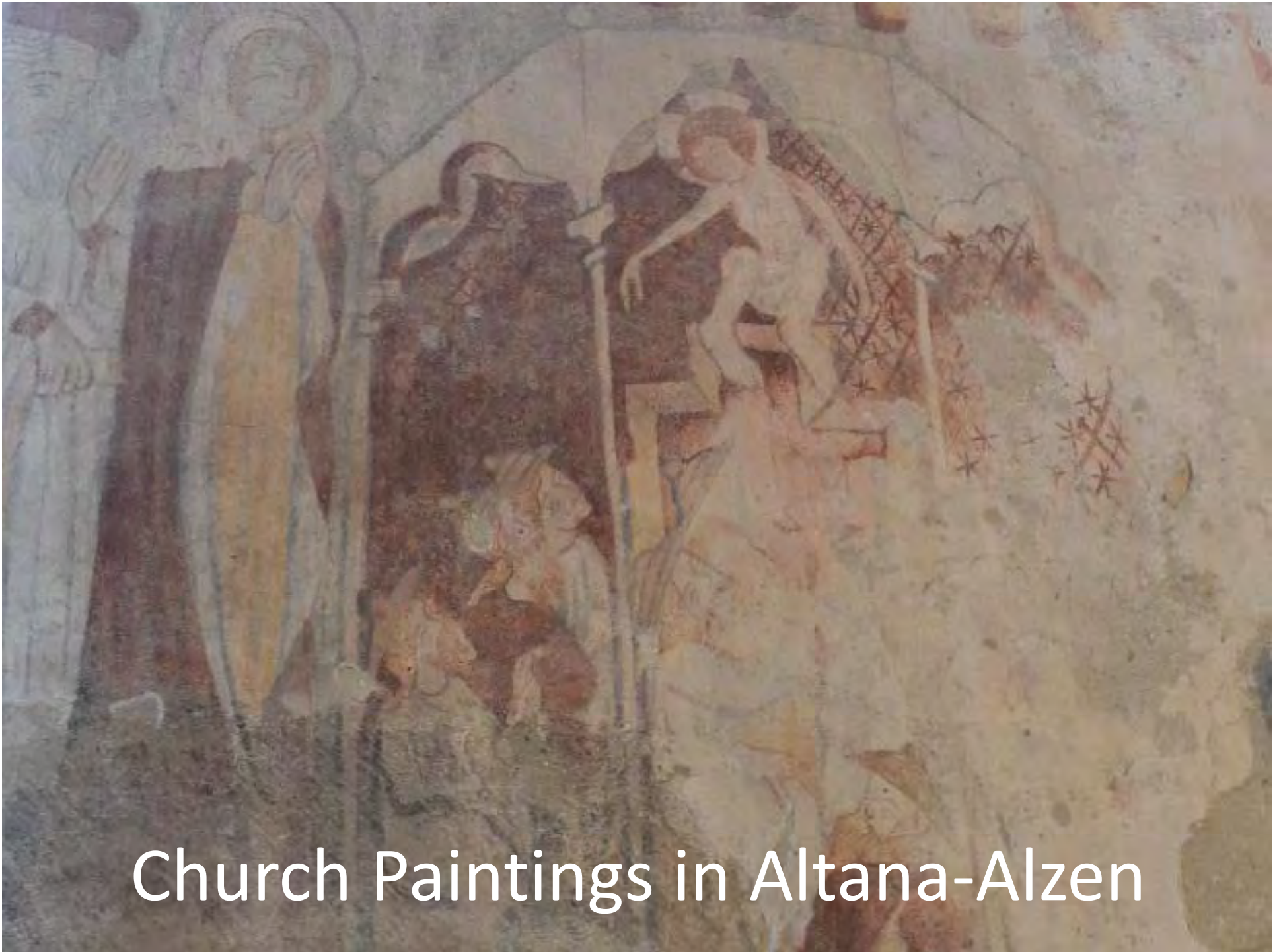
Church Paintings in Altana-Alzen