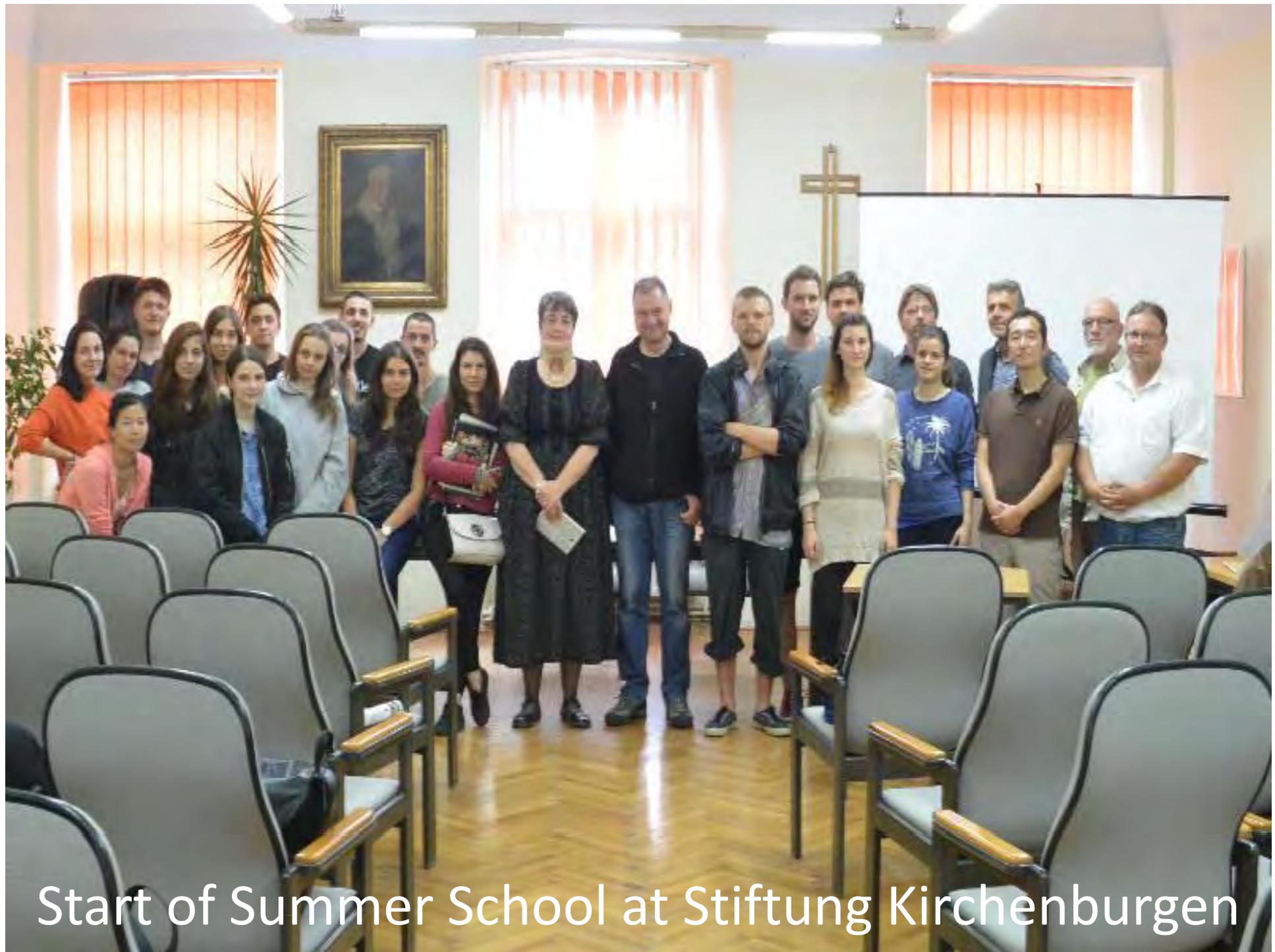
Start of Summer School at Stiftung Kirchenburgen