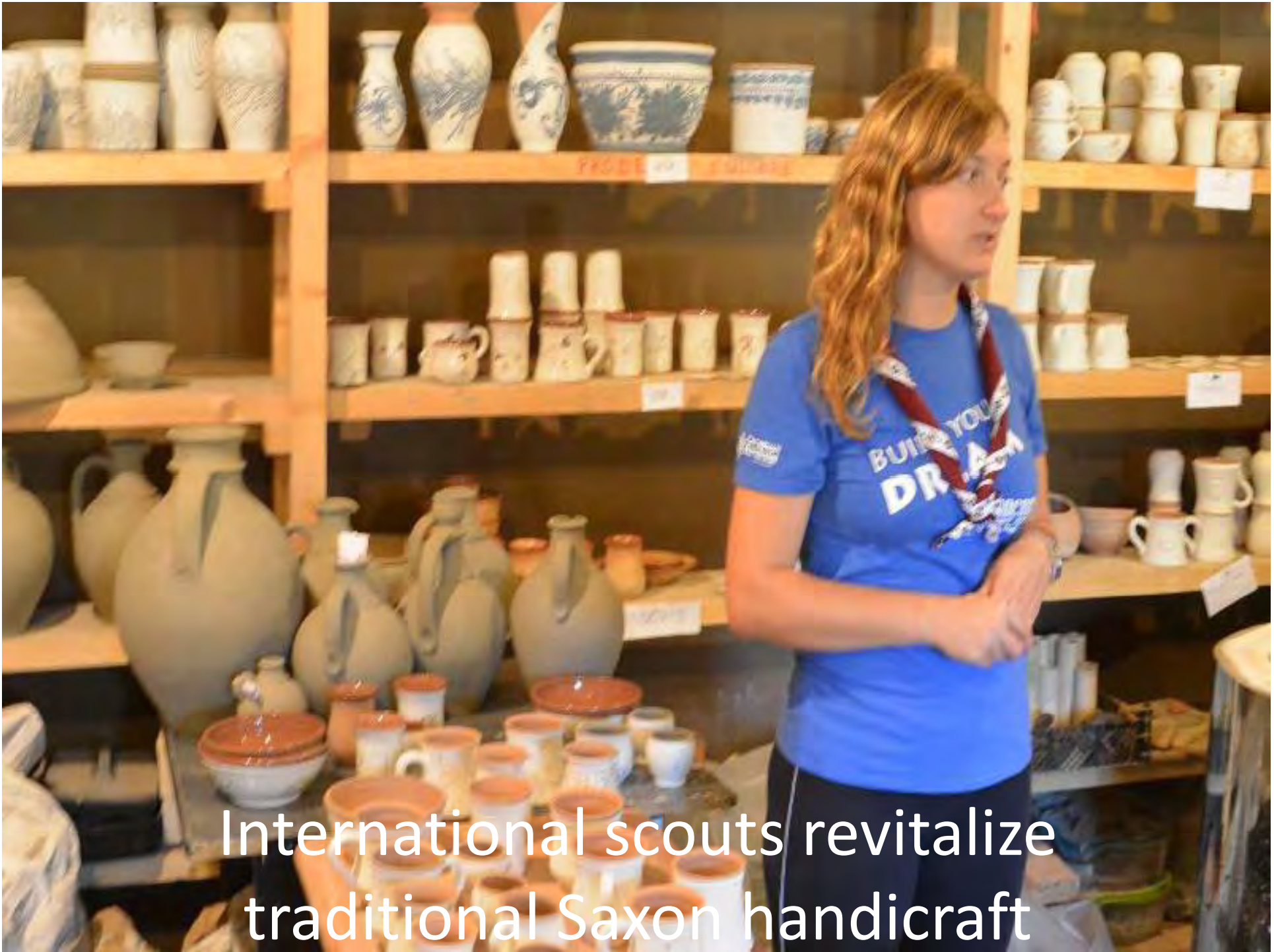
International scouts revitalize traditional Saxon handicraft