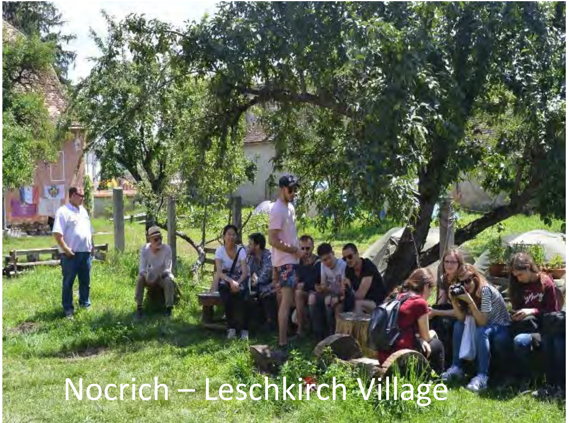
Nocrich – Leschkirch Village