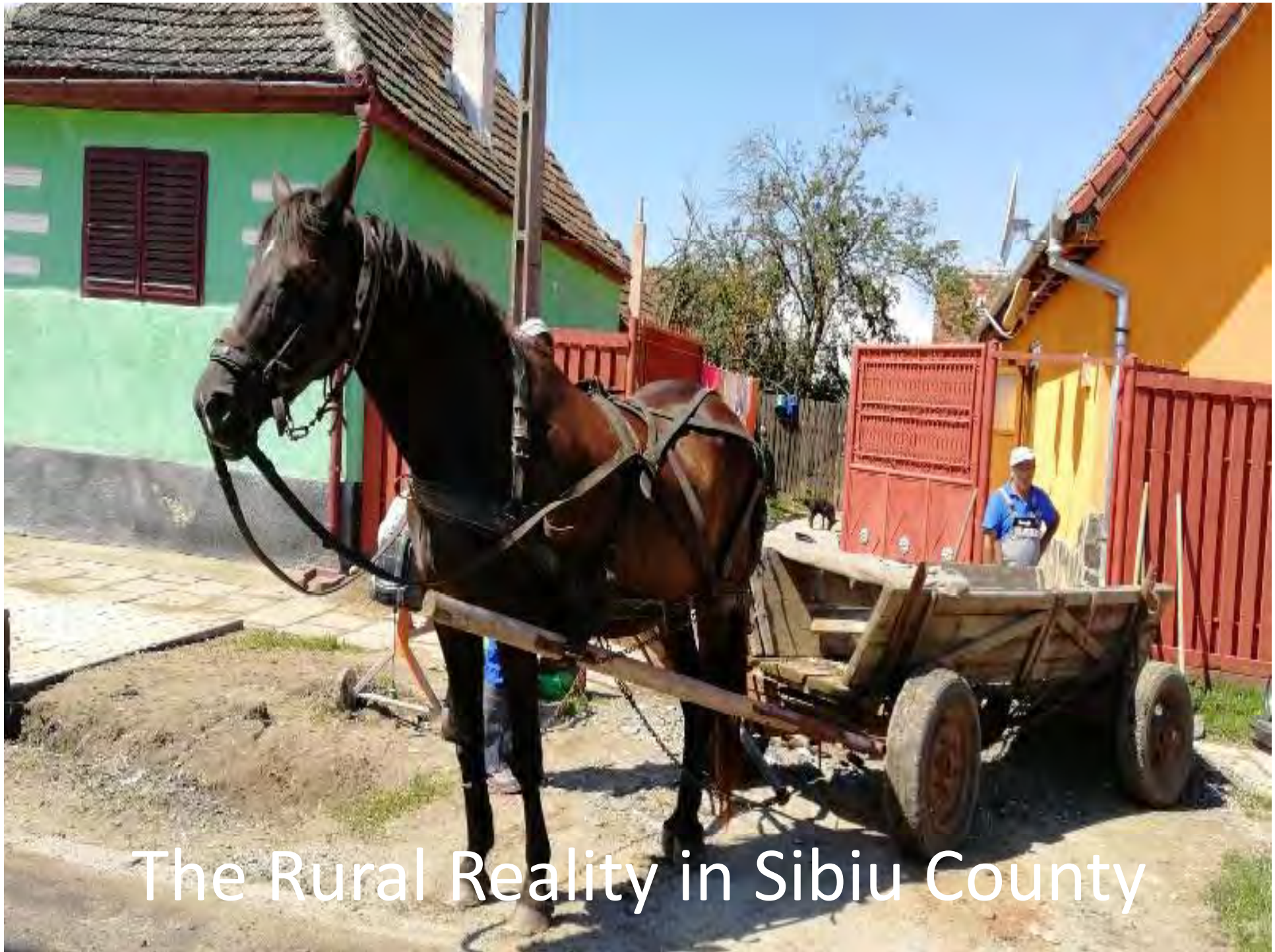
The Rural Reality in Sibiu County